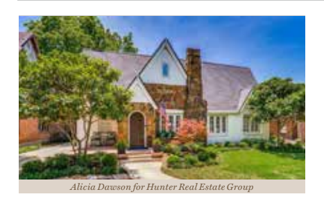
\mathbf{5406\,MERCEDES\,AVE.},\$997,\!000 3 bedrooms, 2 bathrooms, 2,658 square feet Neighborhood: Greenland Hills

"This house is 'cookie cutter' Park Cities but with potential! We'd go all in with paint to bring otherwise forgettable rooms to life. The key is to saturate the entire room (walls/ ceiling/millwork)\,in\,a\,single\,color\,for\,an\,immersive\,feel.