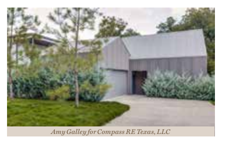
826 KESSLER WOODS TRL., $1, 299,0003 bedrooms, 3.1 bathrooms, 2,558 square feet Neighborhood: Kessler Woods

"The exterior of this cottage is simply charming. It has so much character! On the interior, I would soften each room with drapery and add interest with paint.