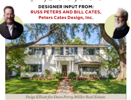
4618 BEVERLY DR., $1,299,000 2 bedrooms, 2.1 bathrooms, 2,850 square feet